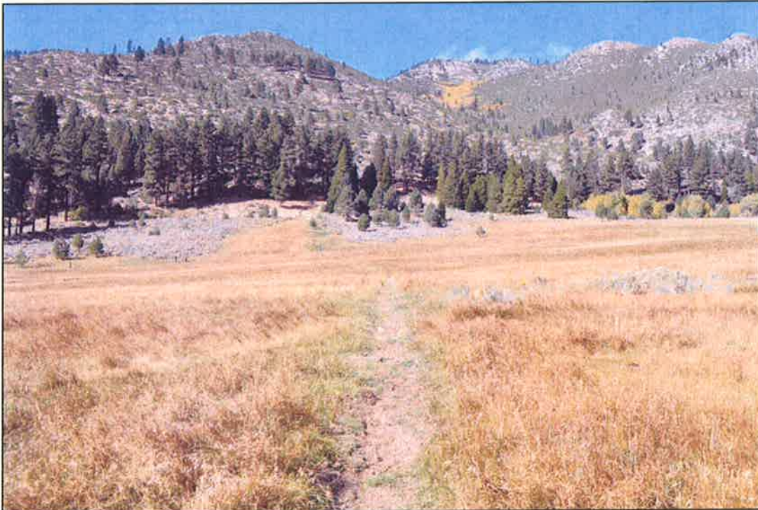
Photo: The photo of the pipeline excavation area has been included to document current condition and vegetation growth.

The previous report recommended monitoring for revegetation along the excavated pipeline area. During this field monitoring visit, preferred grass and forb species were not yet apparent. Rather, annual weeds such as cheatgrass and redstem filaree were most common. If natural revegetation is not successful within a few years, a mix of meadow grasses may need to be purchased and raked into the soil during the late fall months.