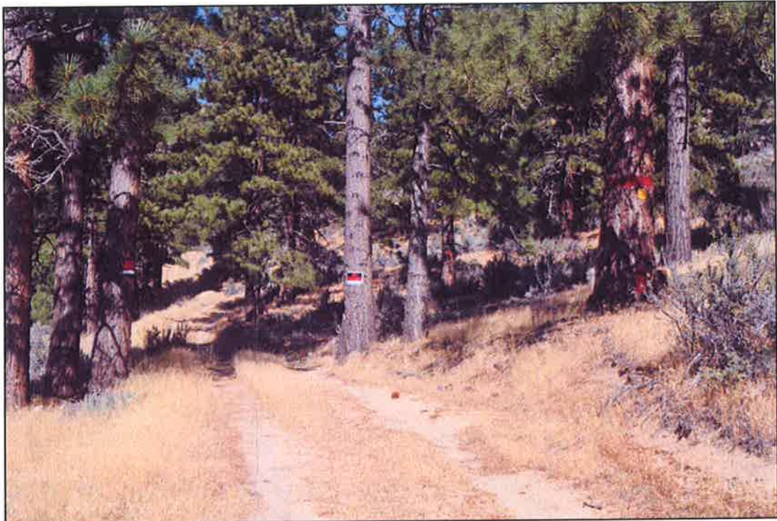
Photo: At the southeast property corner with the USFS, private property and no trespassing signs were posted.