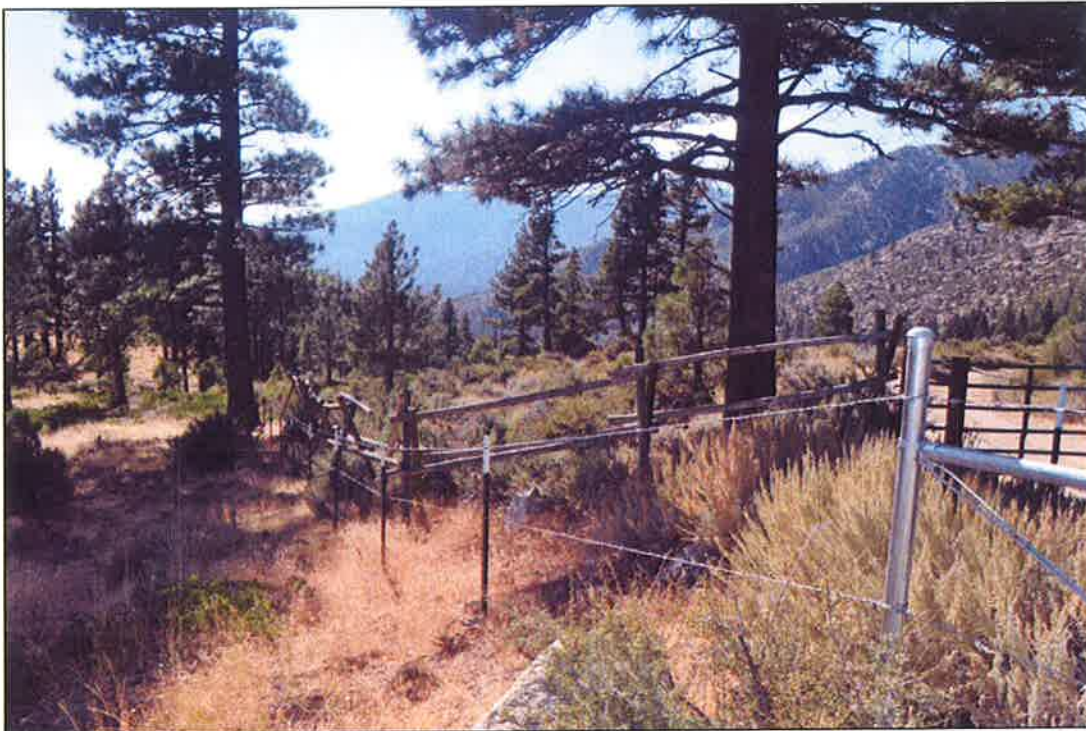
Photo – At the upper gated entrance, a new three-strand barbed wire fence extends to the south.