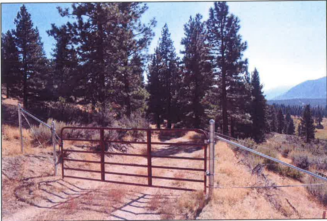
Photo: At the southeast property corner with the USFS, a new gate was installed to control access.