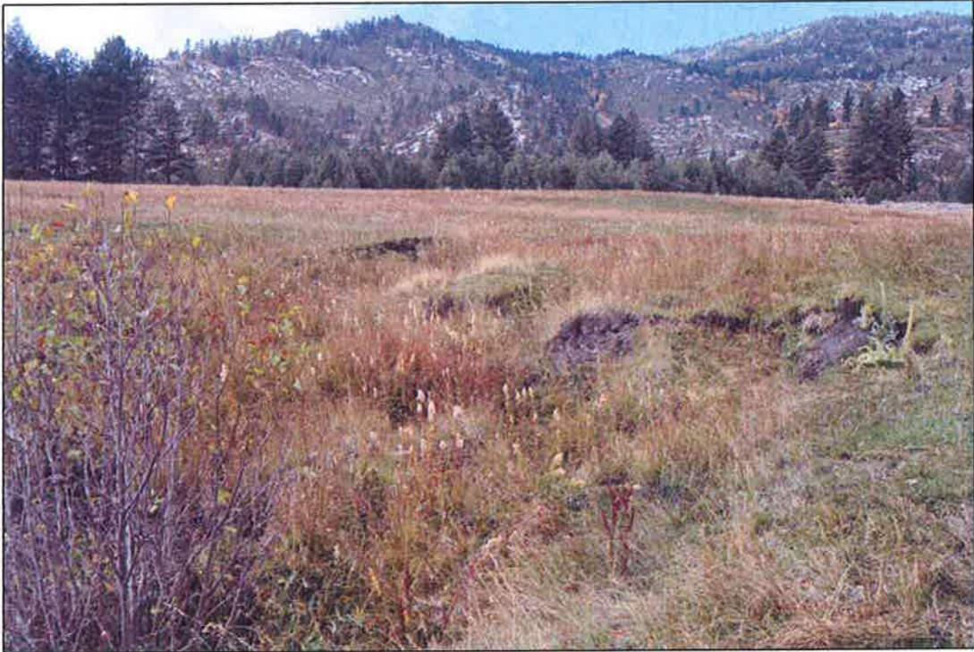
Photo: The photo of this drainage, located south of the cabins, has been included to document current condition and vegetation growth. N 39 07' 42.7" W 119 50' 10.2"

The following is an update and continued monitoring as referenced in the previous report: According to the Mr. Fagen, there was significant winter and spring runoff in the drainage located east of the cabins. Generally, the field conditions appear stable from last year and the vegetation seems to be establishing. Likewise for the lower meadow located south of the cabins. A few areas such as the headcut identified in Photos 4A – 4C should receive some stabilization work though, and Carson City will work with Mr. Fagen towards this goal.