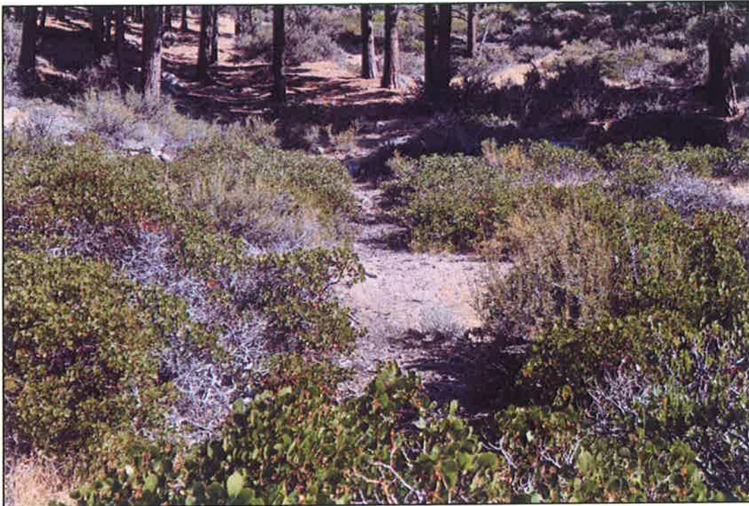
Photo: The previously photographed dirt bike tracks were not apparent. View from the conservation easement uphill to the adjacent USFS lands on the east.

The previous report mentioned a few areas of trespass and the off-road tracks caused by dirt bike use. Since installation of the gate and barbed wire fence, the trespass and unauthorized vehicle use have dissipated.