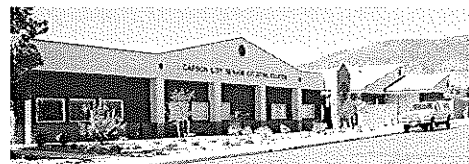
Senior Citizens Center, Carson City NV.