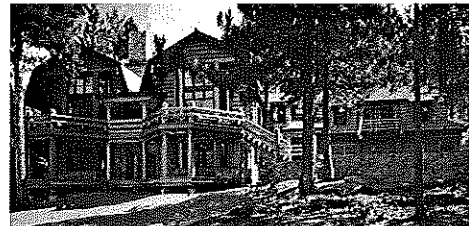
Log Home for Captain and Tennille Lake Tahoe