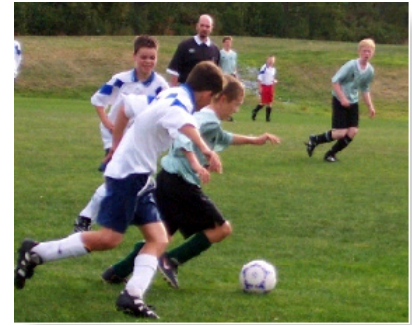
Sports programs help teach teamwork, training and sportsmanship.

In addition to property tax revenues, parks and sports complexes can create additional city revenue through tourism. Well-maintained parks and recreation facilities add to the appeal of Carson City for tourists, and also attract visits to Carson City by residents from surrounding communities. These guests tend to spend money locally, boosting the local economy as well as sales tax revenues. Sports tournaments are a significant contribution to tourism, businesses and city revenues. Through surveys, Carson City has documented that in 2004, sports tournaments brought $2.7 million in participant spending to the community.