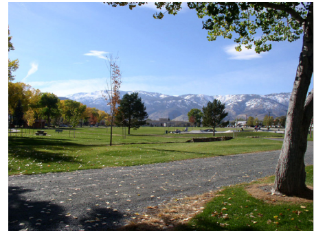
Mills Park is Carson City’s “Central Park”