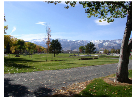
Mills Park is Carson City's "Central Park"