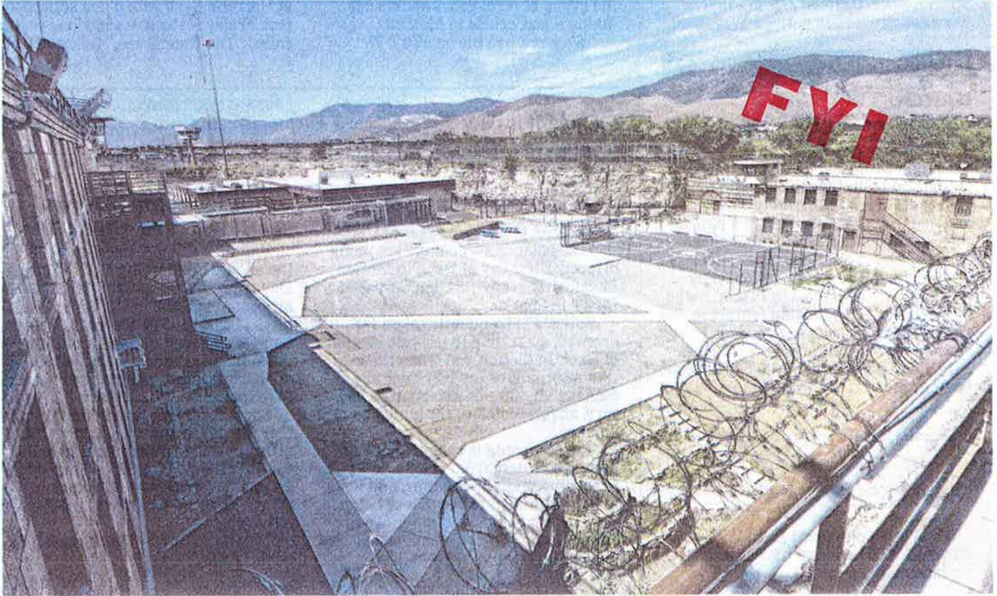
The prison yard at the Nevada State Prison in Carson City as seen from the roof of the building. In the background is the quarry from which the sandstone blocks were hewn for construction of the prison buildings.