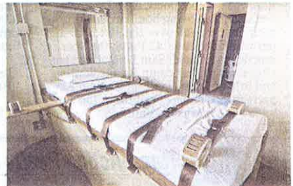
Condemned convicts were strapped to this table for execution at the Nevada State Prison.