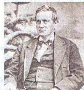
Abraham Curry was the first warden of the Nevada State Prison.