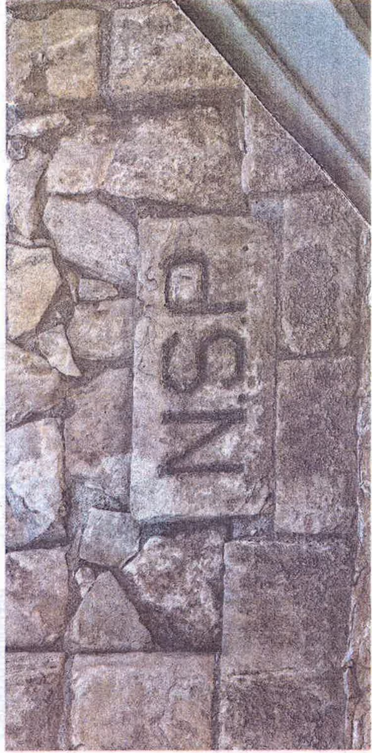
The letters of the prison are carved into one of the hand-hewn sandstone blocks.

six days later camped around a high Sierra lake. One last gun battle ensued and a pursuer named Morrison was killed. All the convicts were captured.