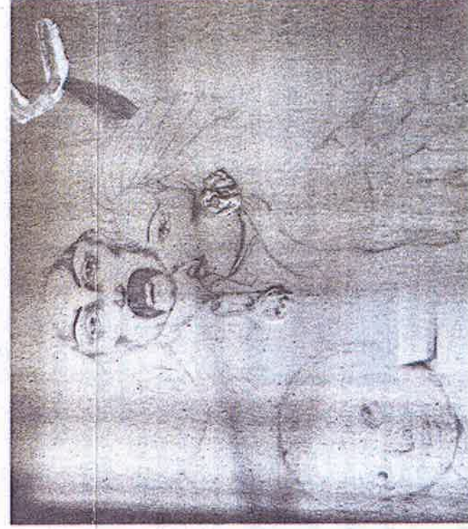
Many convicts have left something of themselves in the form of artwork in Nevada State Prison cells.