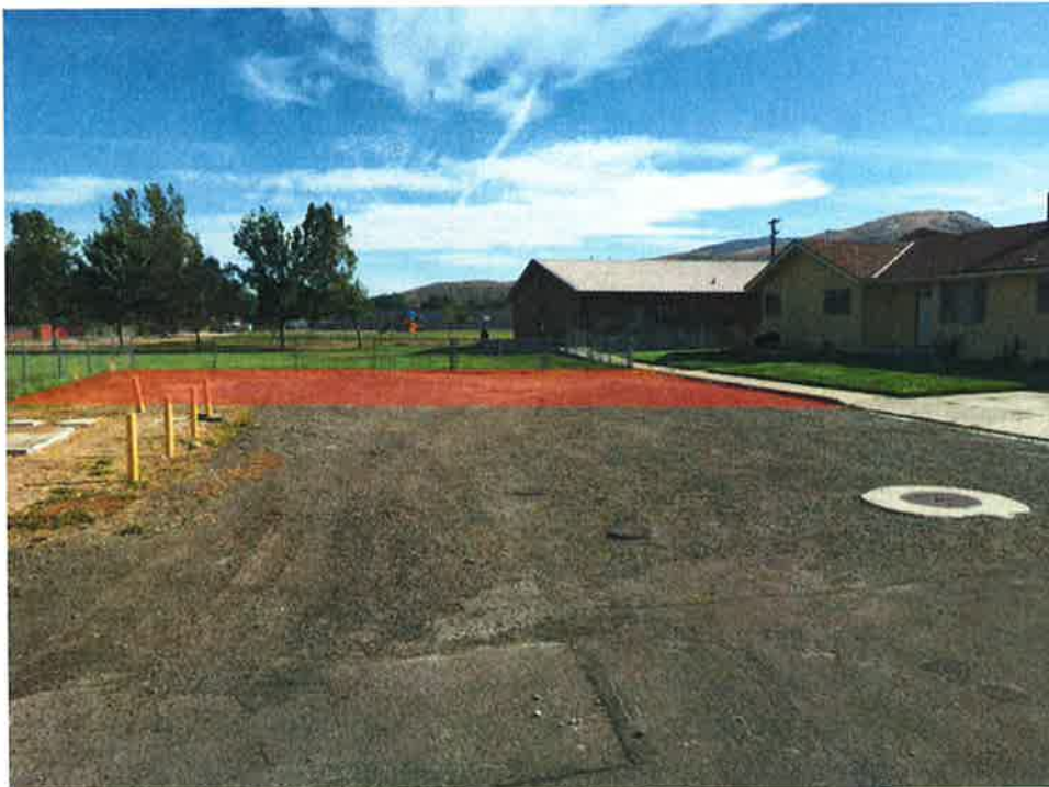
Proposed location of 6' fence and sports courts

The proposed project will not blend seamlessly with the established area as recommended in the Carson City Master Plan. The addition of the proposed 6' high fence and sports courts at the termination of Ivy Street will have an adverse effect on the current aesthetics of the neighborhood. Not only will Ivy Street dead end into a basketball court, the court and fence will also block the front of the existing Parsonage, a house located at 1840 Ivy Street. The proposed sports courts will be only 37' from the end of the asphalt and will appear to be a part of the street itself.